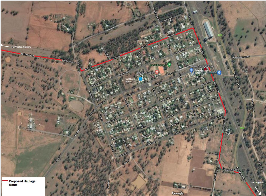
Figure 2. Proposed Coalaceous Haulage Route through Curlewis NSW noting house locations, school and commercial locations.

The Kamilaroi Highway provides regional access to the site. (Figure 2).