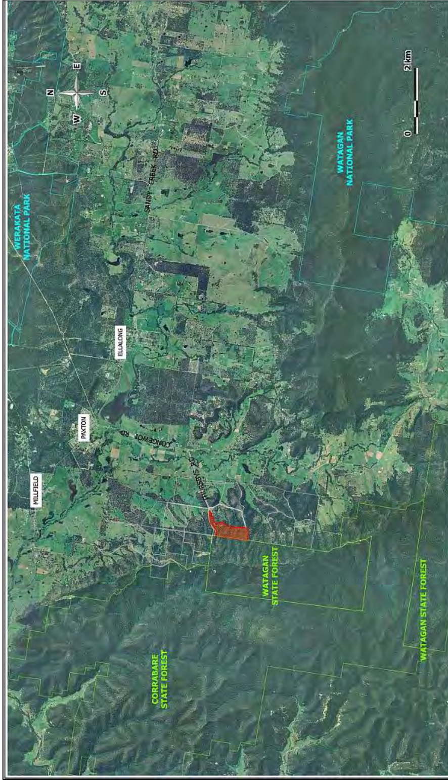
Figure 1 The subject site (red hatch) in a local context