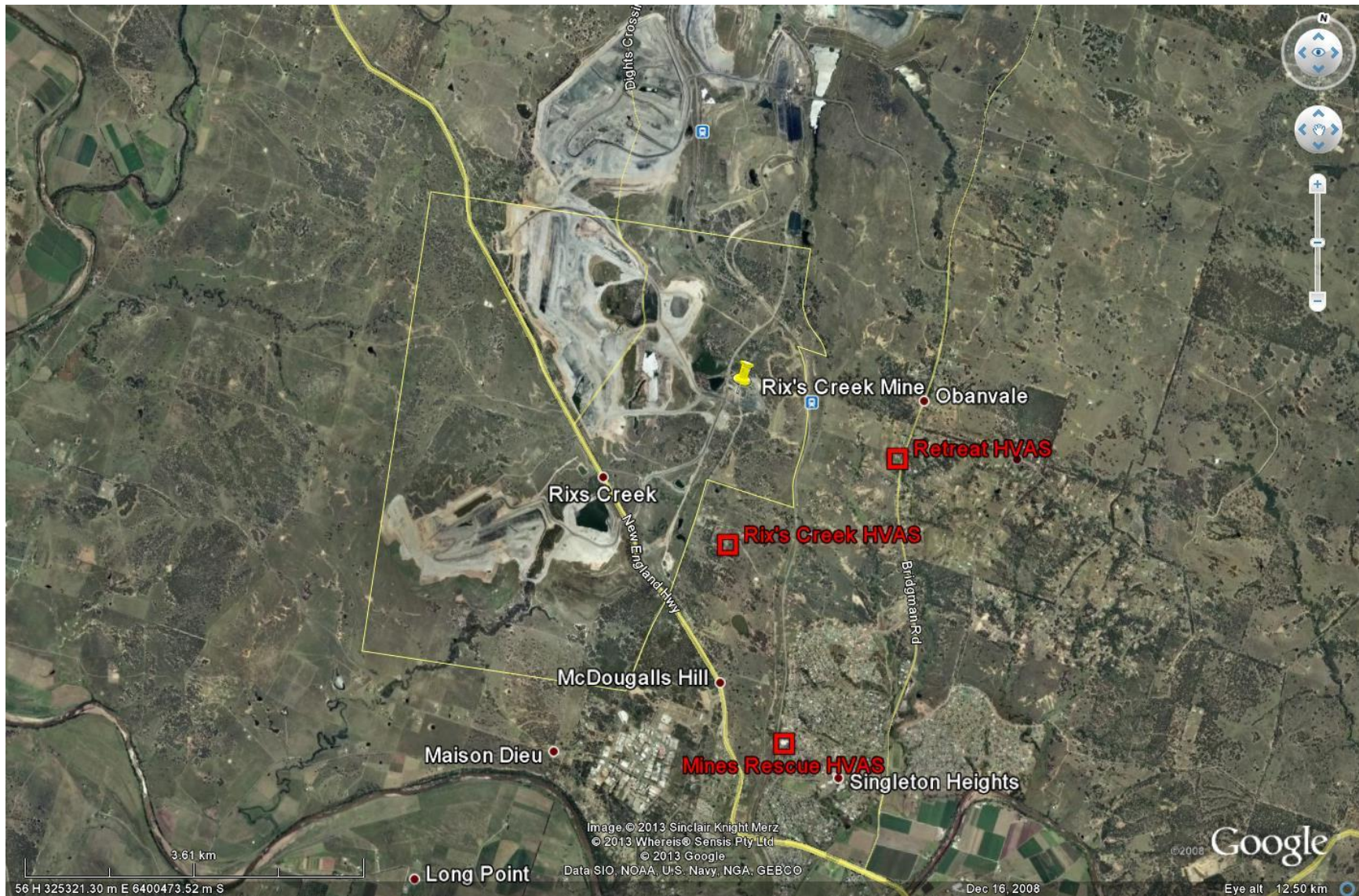
Rix's Creek – High Volume Air Sampler Location Diagram.