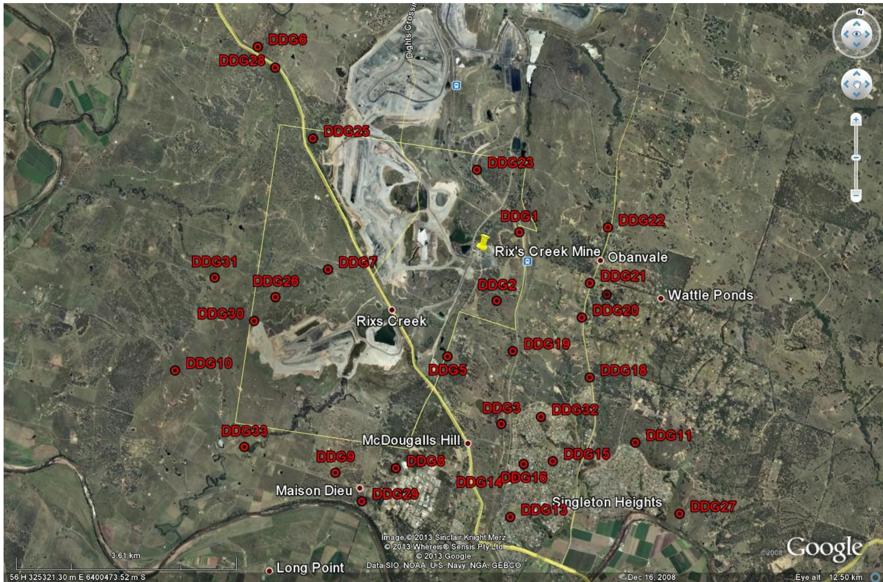
Rix's Creek Mine – Dust Deposition Gauge Location Diagram.