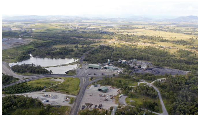
Existing Mine Infrastructure Area

The Mine is an open cut coal mine approximately 5 km north-west of Singleton which currently produces approximately 2.8 million tonnes per annum (Mtpa) of Run of Mine Coal.