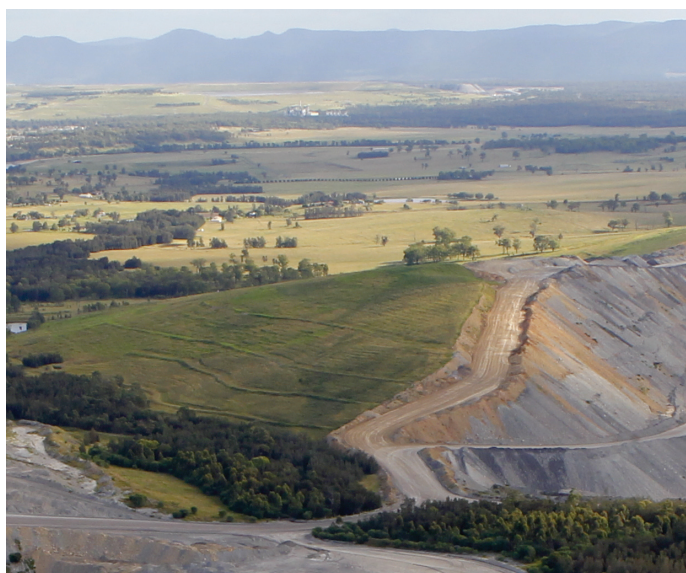
Progressive mine rehabilitation

In addition, The Bloomfield Group will organise community information sessions to provide the community with the opportunity to review project information and ask questions of the Rix's Creek Mine project team. More details on these sessions will be provided in due course.