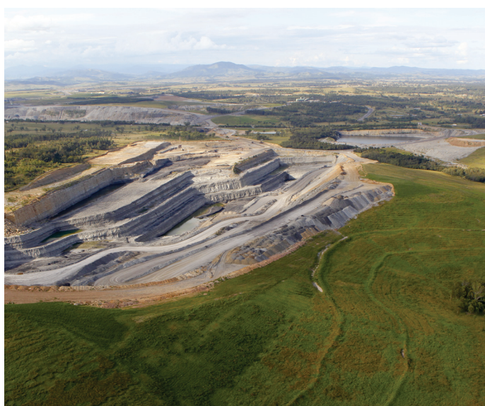
Existing Pit 3 and progressive rehabilitation