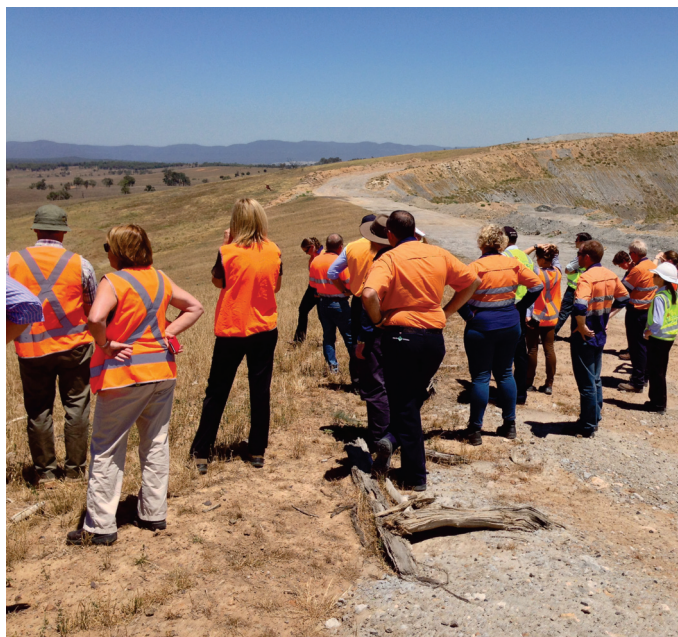
Planning focus meeting mine inspection by government agencies